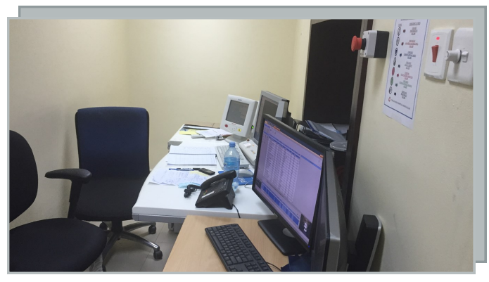
The CT Control Room at AKHD

and fellows visiting East Africa. We will be sharing general safety tips as well as standard preventive and practical healthcare recommendations with them.